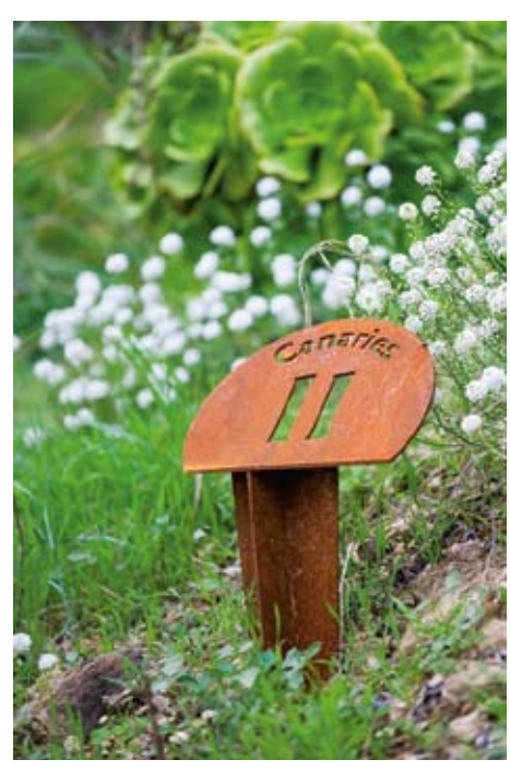
Country Life, December 1, 2010 57