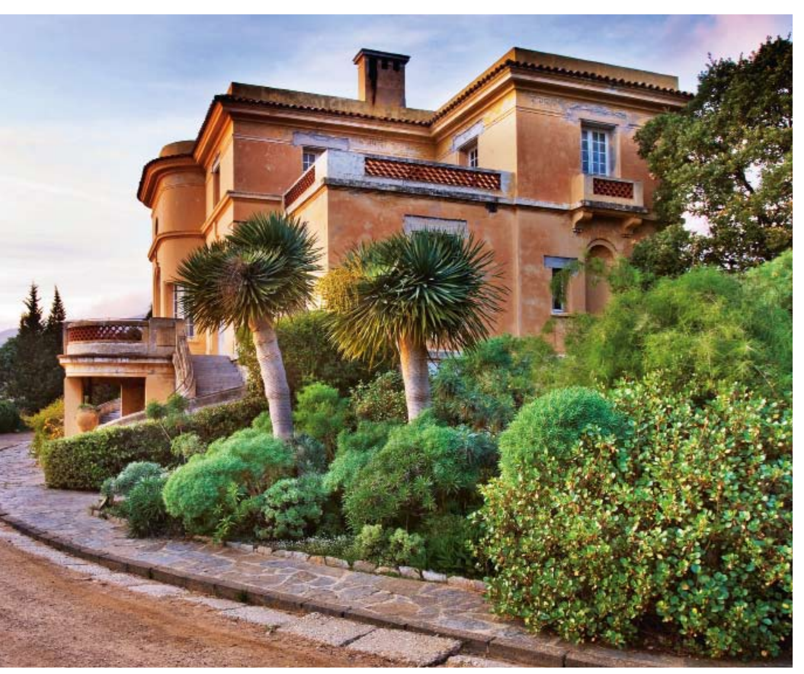
Above The former Hôtel de la Mer. In the foreground (left to right) are Echium virescens, Euphorbia regis-jubeae, Nauplius sericeus, Rumex Iunaria and Asparagus pastorianus. Facing page The walk begins with dramatic Dracaena draco from the Canary Islands

main reception building for the gardens, which are open to the public all year round. Other historic vestiges include a smaller Art Deco house with a formal garden on the eastern promontory, a fisherman's dwelling (now a guest house) and farm buildings, now the Café des Jardiniers. Allied landings nearby spared the Rayol, but a subsequent period of abandonment opened the site to potential speculation. In 1989, it was finally purchased by the French shoreline conservancy agency, the Conservatoire du Littoral.